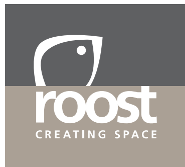
Primary two-colour Reverse