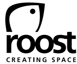
One-colour use Black & White