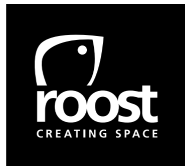
Black & White Reverse